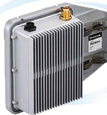
OvisLink Wireless High Power Outdoor Solutions

The AirLive Outdoor family is the most complete outdoor wireless solution in the industry. There are 6 models to meet the demand of all type of environment and applications. They allow transmission distance up to over 30 kilometer in open space. Every model is constructed of rock solid weather-proof cast aluminum to operate in the most extreme environment.